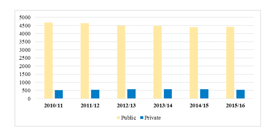
Fig. 6. Number of public and private educational institutions in school years

Second, demand is influenced by two different factors: on the one hand, demographic pressure and on the other – the change in socio-economic factors, e.g. increasing the share of people at risk of poverty and social exclusion, rising morbidity and disease, etc. Therefore, in health and social services there is a trend of increased demand, and in the case of education it drops.